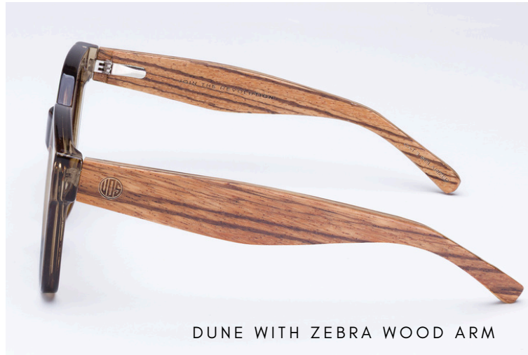
DUNE WITH ZEBRA WOOD ARM