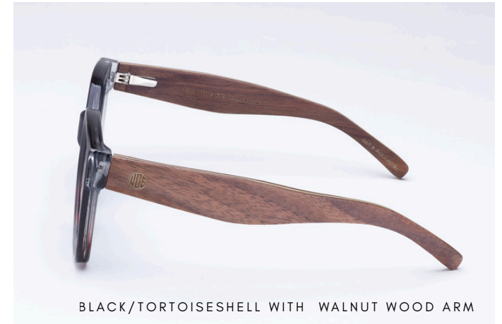
BLACK/TORTOISESHELL WITH WALNUT WOOD ARM